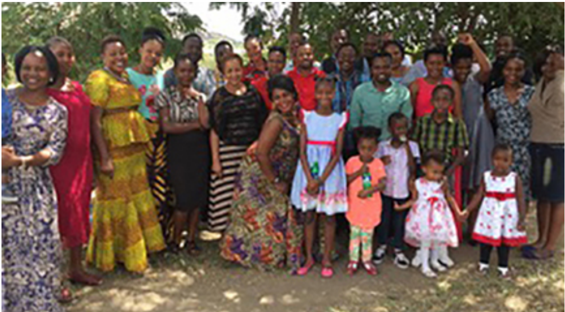
New Life Band families