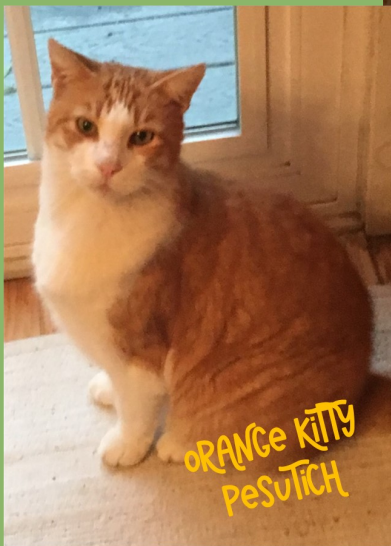
ORANGE KITTY Pesutich